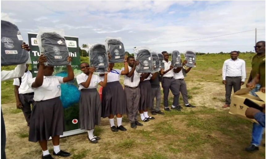
Photo: Mwandege Mikoko Club Members who won awards for Climate Change Actors (Awards supported by Vodacom Tanzania Foundation and WWF – Tanzania)

Example, student might prefer to participate measuring of the area and at the end of the day the given project results to engineering with application of mathematical formula and also engage student into a leadership programs in the club, when it comes to the academic issues it allows young adult to develop ability of understanding class topics through practical sessions given by Mikoko Club at school and allow him or her to win a badge that recognize his or her ability and efficiency in a given field activity.