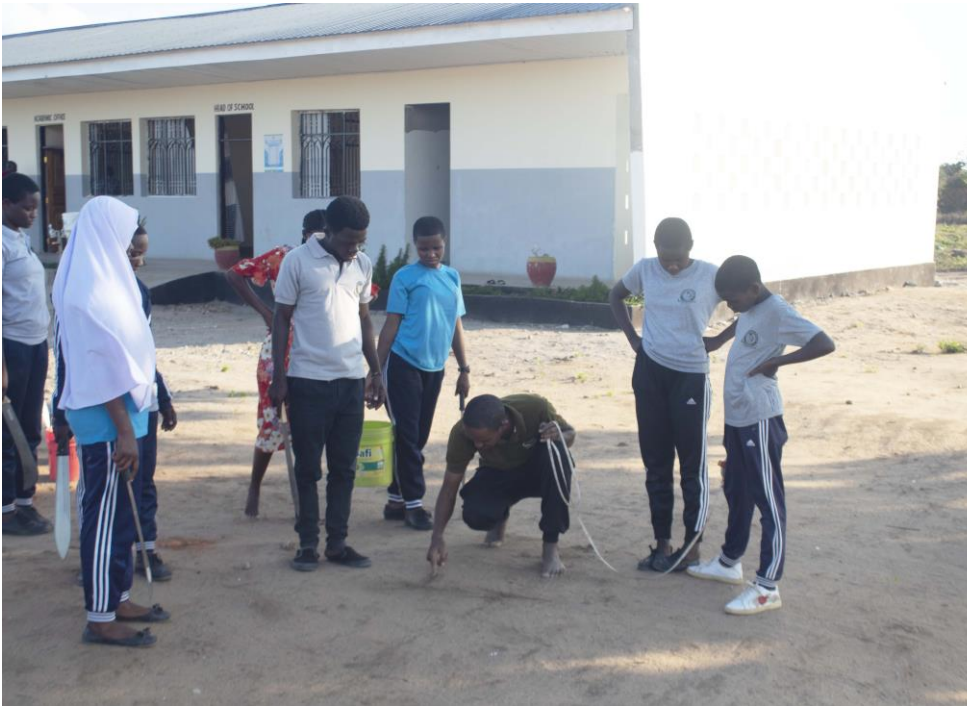
Photo: Mikoko Club member at Jokate Mwangelo Secondary School during planning and assessment of areas for the aim of greening with their club patron and environmental school teacher.