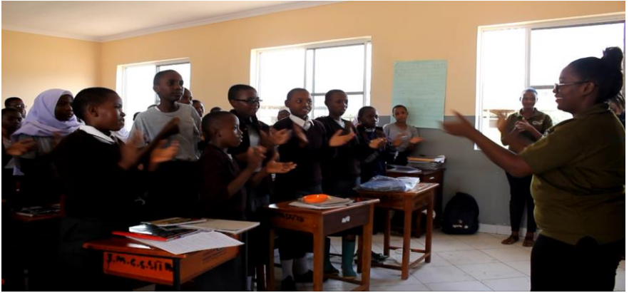
Photo: Members of Mikoko at Jokate Mwangelo Secondary School during club meeting