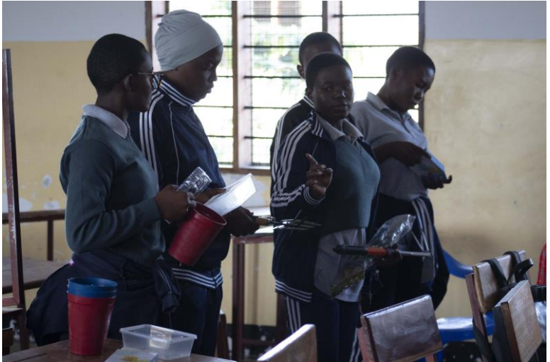
Photo: Mikoko Club members from Jokate Mwagelo Secondary School presenting their project during Mikoko Nature & Environmental Camp 2022 at Mkuranga District.